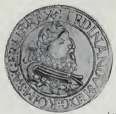
Lot No. 3046